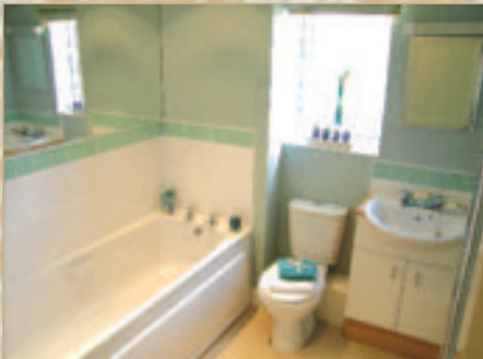
Images of a typical Soha home. Finishes may vary from those shown, due to our policy of continuous development.

Computer generated images (CGI) have been created from an imaginary viewpoint within an open space area. Its purpose is to give a feel for the development, not an accurate description of each property. The CGI shows a typical Soha Housing Limited house of this type, but there may be variances from site to site. External materials, finishes, landscaping may vary throughout the development. Homes may also be built handed (mirror image). Please enquire for further details.